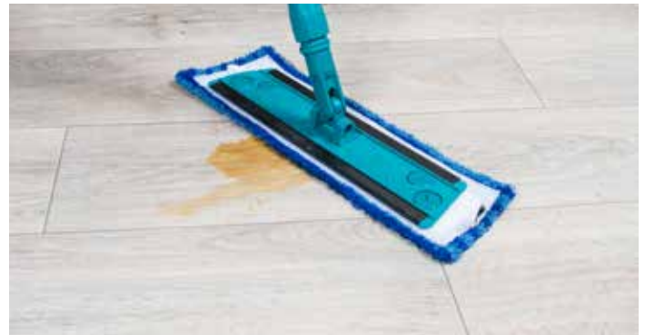
► Clean up spillages with a slightly moist mop